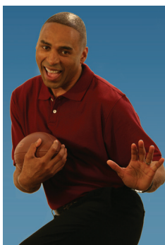
Roger Craig Former NFL Running Back

Read what the champions are saying about Stemulite at StemuliteFitnessFormula.com