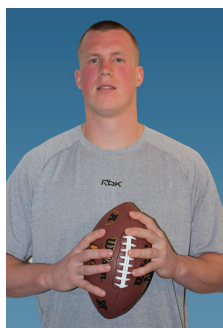
Kevin Boss NFL Tight End